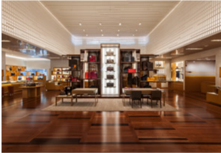
Louis Vuitton Hilton Hawaiian Category: Interior Architecture and Design

General Contractor: Gold West Construction