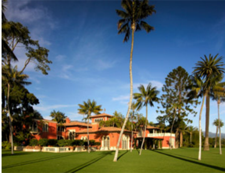
Villa Las Palmas Category: Santa Barbara Architectural Heritage

Thomas Bollay Architects, Inc.