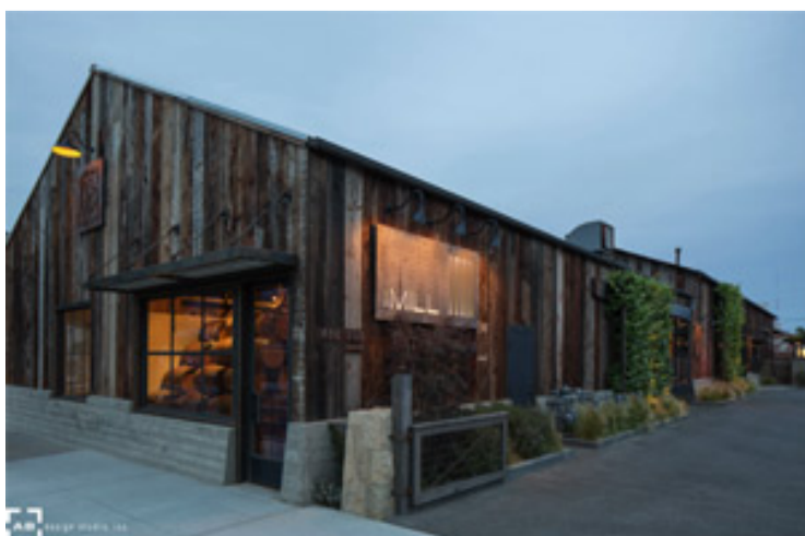
The Mill Category: Non Residential

AB Design Studio, Inc.