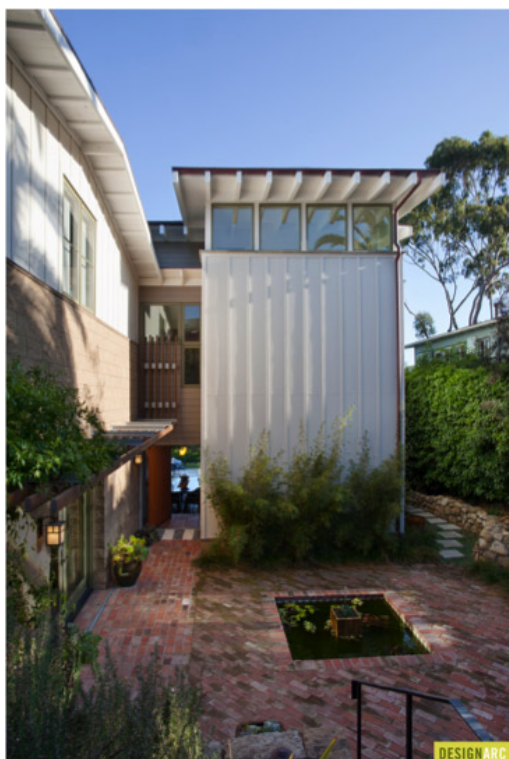
Villa Vlahos Category: Residential

General Contractor: Sierra Pacific Constructors