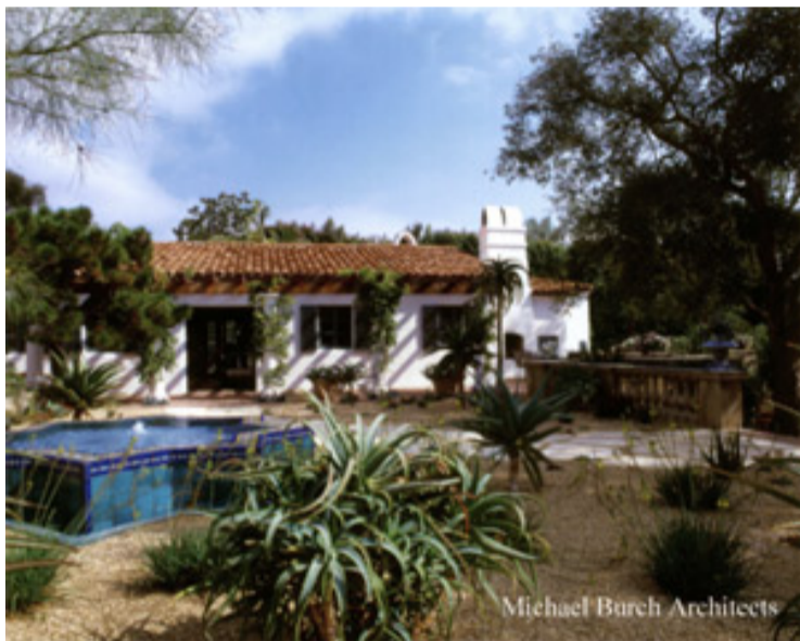
George Washington Smith Estate Category: Santa Barbara Architectural Heritage

General Contractor: Dickinson Cameron Construction