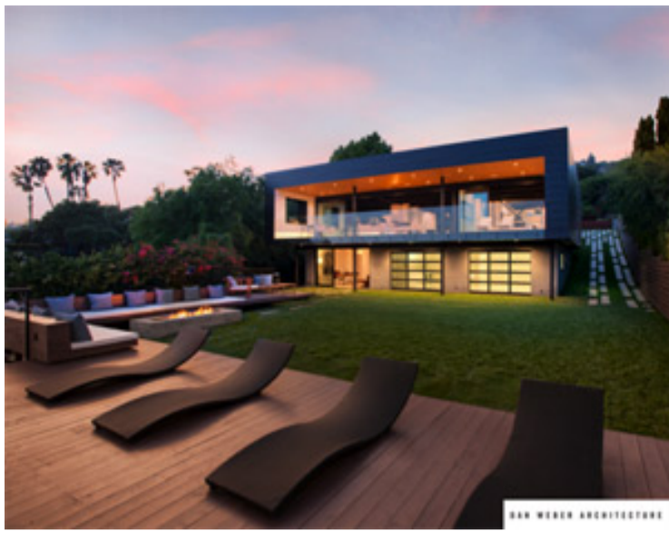
Paseo Ferrelo Category: Residential

Dan Weber Architecture