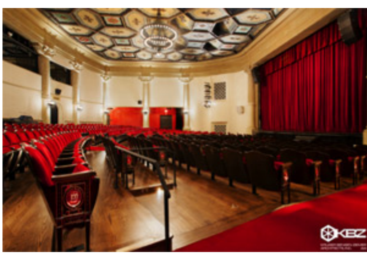
Lobero Theatre Renovation Category: Interior Architecture and Design

Kruger Bensen Ziemer Architects