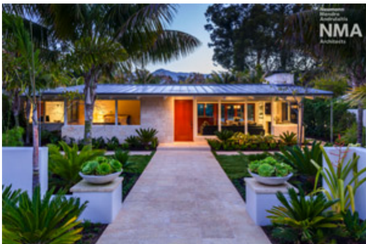
Butterfly Beach Villa, Santa Barbara Category: Residential

Neumann Mendro Andrulaitis Architects