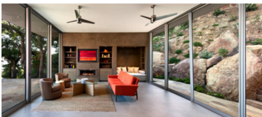
Mountain Drive Cabana Category: Small Projects