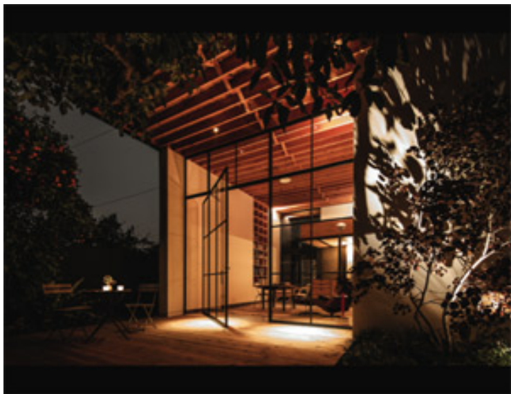
Bento Box Category: Small Projects

General Contractor: Giffin & Crane General Contractors