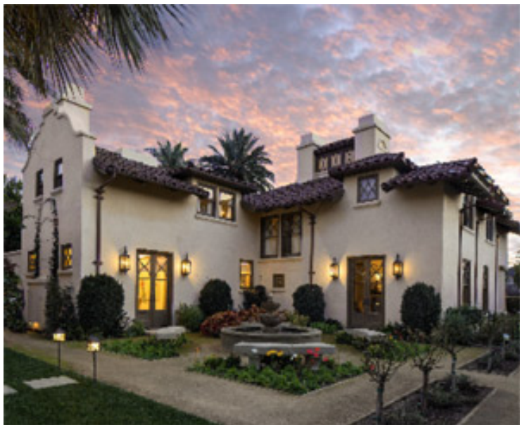
2050 Garden Street Category: Santa Barbara Architectural Heritage