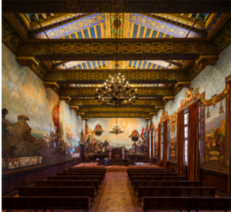
Santa Barbara Courthouse Mural Room Category: Historic Preservation/Renovation

General Contractor: Young Construction Local Consulting Architect: Winick Architects, Inc.