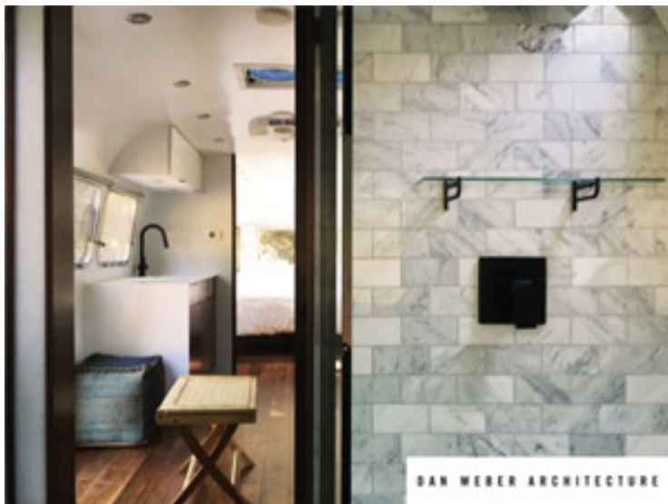
Autocamp Russian River Category: Small Projects

Dan Weber Architecture (now known as Anacapa Architects)